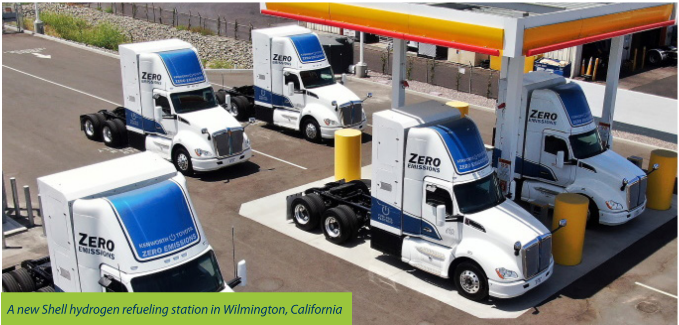
A new Shell hydrogen refueling station in Wilmington, California