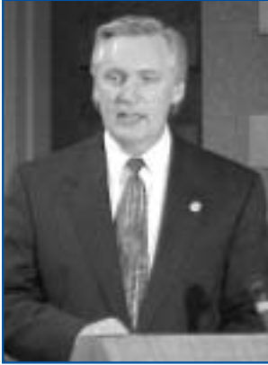
Commissioner Elwyn Tinklenberg

Commissioner Elwyn Tinklenberg, Minnesota Department of Transportation (Mn/DOT)