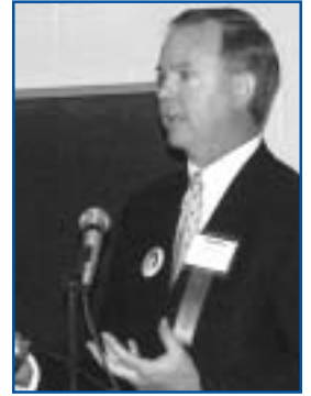
Commissioner Charlie Weaver

To put the issues of traffic safety in public view we must employ creative, out-of-the-box thinking and get rid of the "Minnesota Nice" attitude when it comes to advertising and public relations efforts. Many traffic safety-related ads from Australia have powerful messages that hit the public right between the eyes. I suggest the need in this country to move in that direction and rethink some of the current marketing strategies in order to capture the public's attention on a very real problem that is killing sons, daughters, moms, and dads.