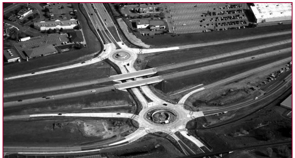
A new roundabout in Cottage Grove, Minnesota

and noted that Washington County officials are willing to share materials and ideas with other cities that are considering the development of a roundabout. "The Internet is an extremely powerful tool for sharing information such as this," Schoenecker added. CTS