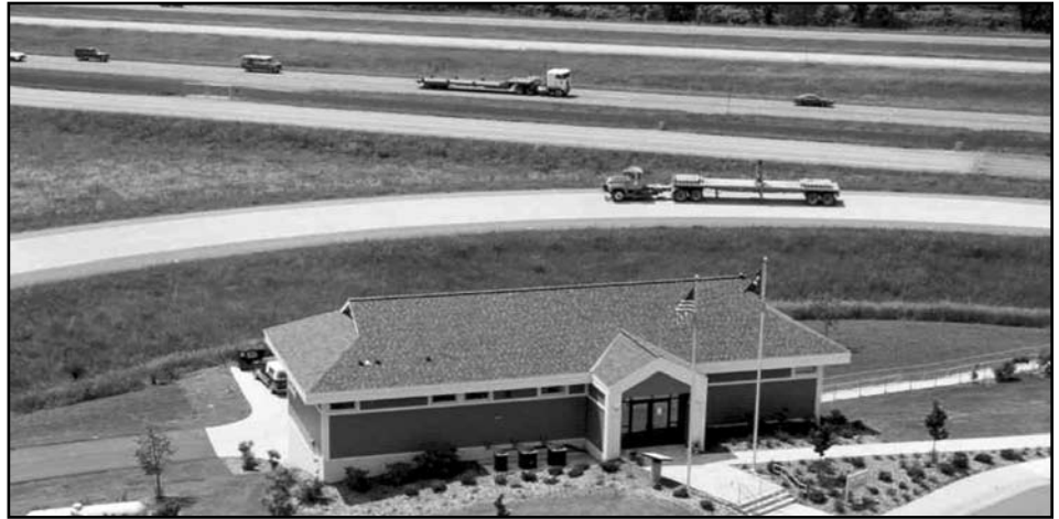
A tour bus will loop through the MnROAD pavement facility during the July 30 open house.

Representatives from TERRA, Mn/DOT, local government, and industry will be on hand to discuss TERRA-initiated research under way as part of the MnROAD Phase Two Research Initiative as well as the latest innovations