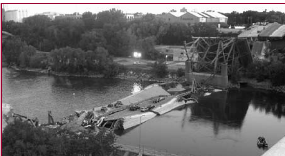
The I-35W bridge over the Mississippi River collapsed August 1.