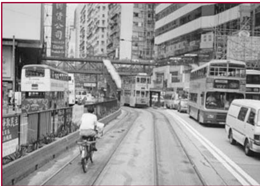
Ninety percent of daily trips in high-density Hong Kong are made by public transit.

The conference continued with a day and a half of technical presentations for invited participants. A summary of the conference will be available from CTS later this year ( www.cts.umn.edu/access-study ). Selected conference papers will be published in the Journal for Transport and Land Use , a new journal under development by Levinson and Krizek with assistance from CTS ( www.jtlu.org ). CTS